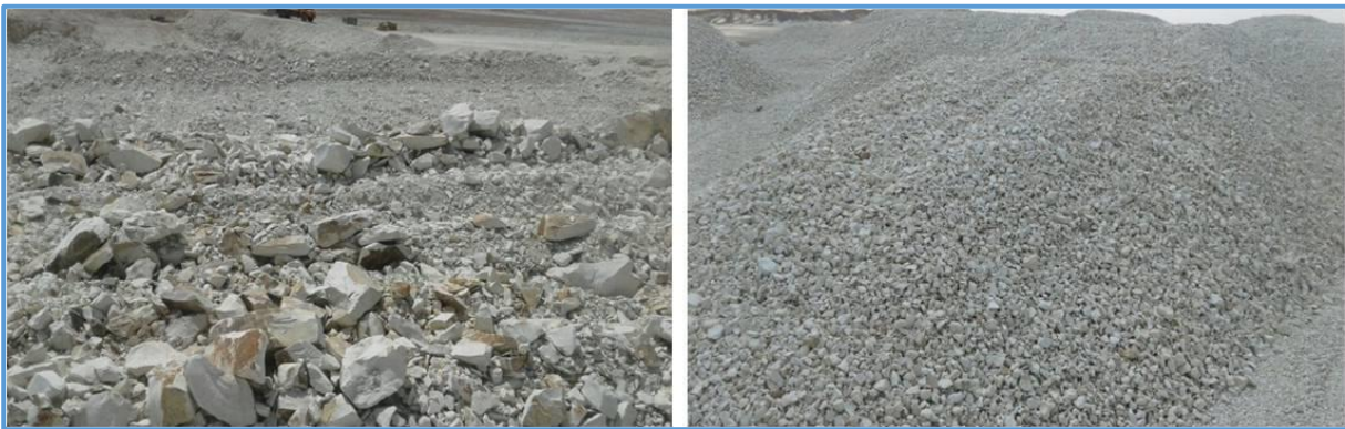
Fig. 1 - Zeolite mine (left) and accumulation (right) in Semnan Province [Pictures by K. Azmun].

Aftar zeolite resources (35°37'53"N, 53°2'27"E) are situated 32 km NW of Semnan city and 5 km NW of Aftar village, between Aftar and Arvaneh. This deposit is one of the best-studied in the country. Clinoptilolite layers in Eocene tuffs contain more than 600,000 tons of high quality material (85-95% clinoptilolite content). The deposit is in the form of a band extending E-W with outcrop thickness from 15 to 110 m.